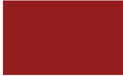
Signal Red P 59402