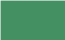
Evergreen P 1461