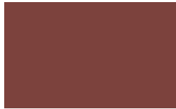
Reddish Red 59225