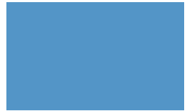
Glacier Blue 59233