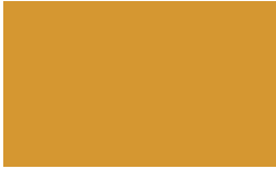
Sunshine Yellow P 59222